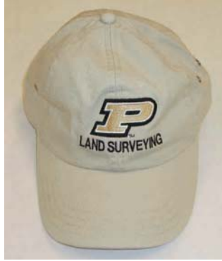
Black and Tan Hats with Purdue Motion P and Land Surveying Logo