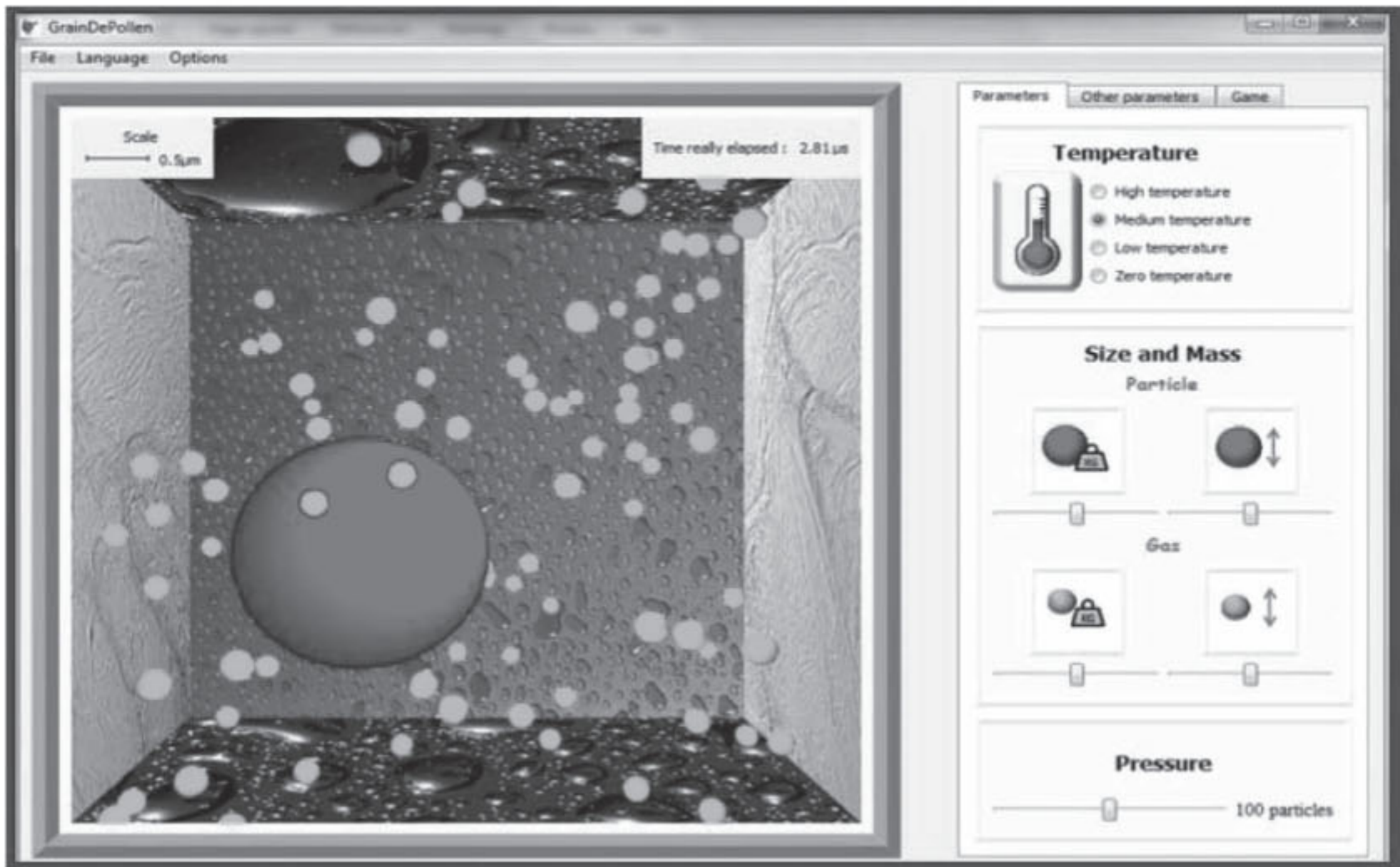
Figure 3. The Pollen Grain instructional program, showing the particles in a closed system and the slider bars that control temperature and pressure.

simulation. The intensity of the force feedback depended upon the temperature and pressure settings in the simulation.