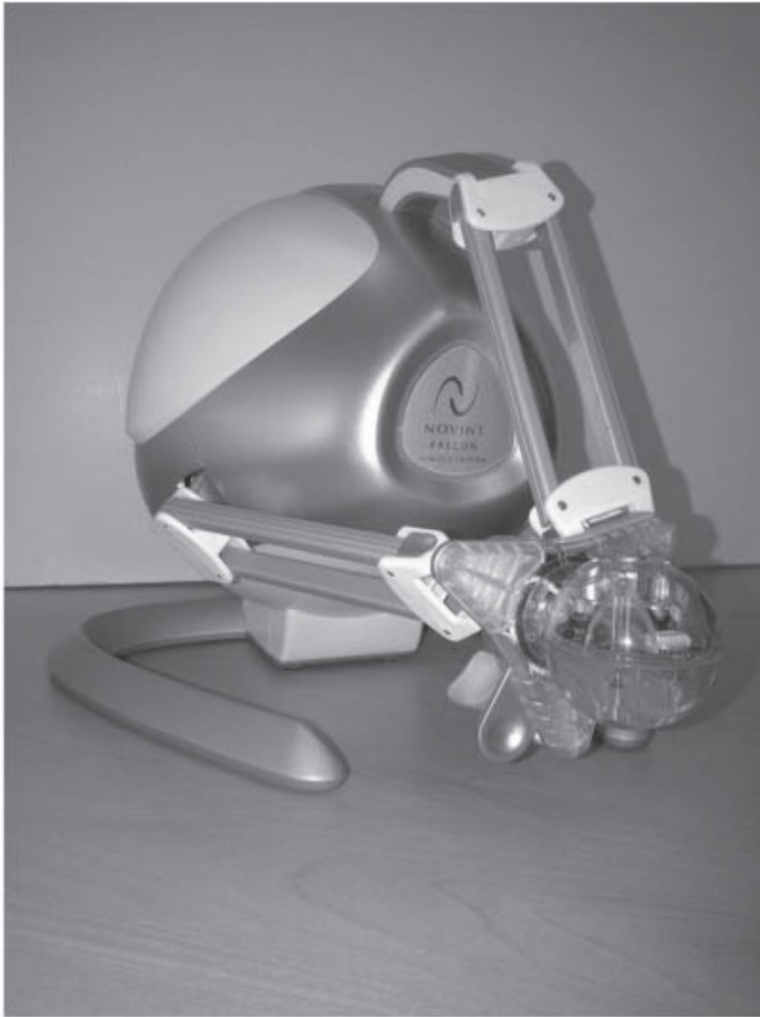
Figure 1. The Novint Falcon device, which utilizes a grip bubble that allows individuals to control objects in a computer simulation or game.

dimensions: up and down, forwards and backwards, and right to left. While the participant is moving the grip bubble, the Novint Falcon's sensors are able to communicate with the computer, detailing the participant's movement within a computer program. In addition, the grip bubble connected to a computer allows participants to manipulate objects in a computer simulation while providing tactile feedback to the participant.