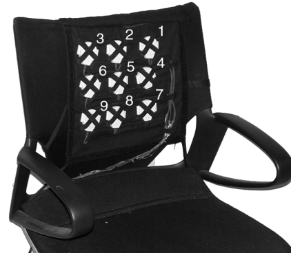
Figure 2. The tactor array used for haptic cueing.

array was draped over the back of an office chair (Fig. 2). For the experiments in the current study, only the four corner tactors (i.e., tactors No. 1, 3, 7, and 9) were used. Each tactor was independently driven by a 60-ms long sinusoidal pulse. The frequency of the pulse corresponded to the resonant frequency of each of the four tactors, and was between 290 and 306 Hz. The intensity of the stimulus was between 26.1 and 27.9 dB SL under unloaded condition (i.e., without the subject pressing their back against the tactors).