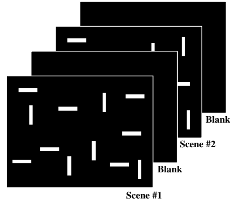
Figure 1. Illustration of the sequence of visual stimuli for the change-detection task displayed on a computer monitor.

The experimental apparatus for haptic cueing consisted of a 3-by-3 vibrotactile display developed at the Purdue Haptic Interface Research Laboratory. The tactor