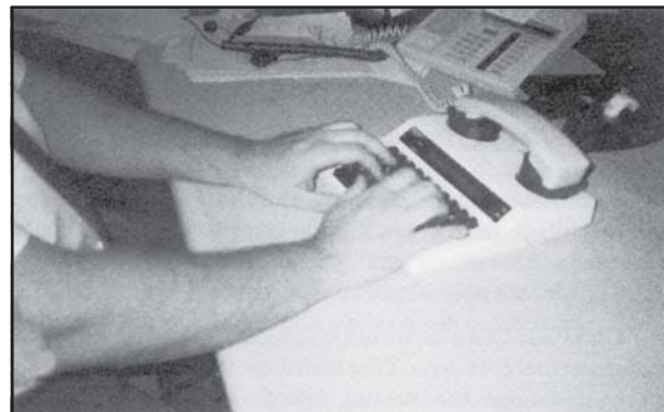
Figure 5: Individuals with speech impairments can also use text telephones (also known as TTYs or TDDs) to communicate by telephone.

Farmers who have a hearing impairment will need more than technology to accommodate their loss of hearing. They will also need to develop accommodating work strategies for the farm.