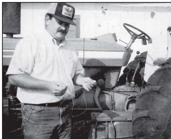
Figure 3: Ear plugs are an efficient means of safeguarding against noise-induced hearing loss.

available in many shapes and sizes to fit individual ear canals and they can be custom made ( Fig. 3 ).