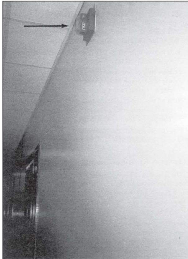
Figure 4: Strobe lights on fire detectors flash when the alarm is activated.

In addition to hearing aids, the following are a few of the many personal aids available. Neckloops are worn around the neck for use with a hearing aid T-coil. The neckloop has a plug that can connect to the output jack of a personal receiver, a television set, a radio, or other audio instrument. Some alarm clocks flash a strobe light or vibrate your pillow or bed to signal, "Time to wake up!" Phone call signalers alert you of an incoming call by flashing a lamp on and off. Closed captioning decoders print a TV program or videotape's dialogue and sound effects on the TV screen, similar to subtitles