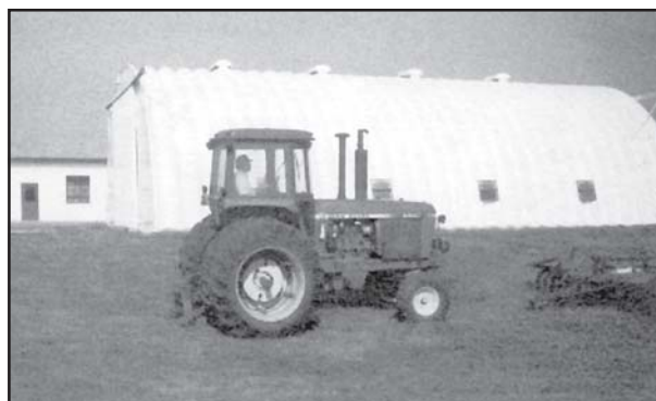
Figure 2: The tractor cab is an example of isolating a person from a noise source.

Ear plugs are small, soft inserts placed into the outer ear canal. They must totally block the ear canal with an air tight seal to be effective. Plugs are