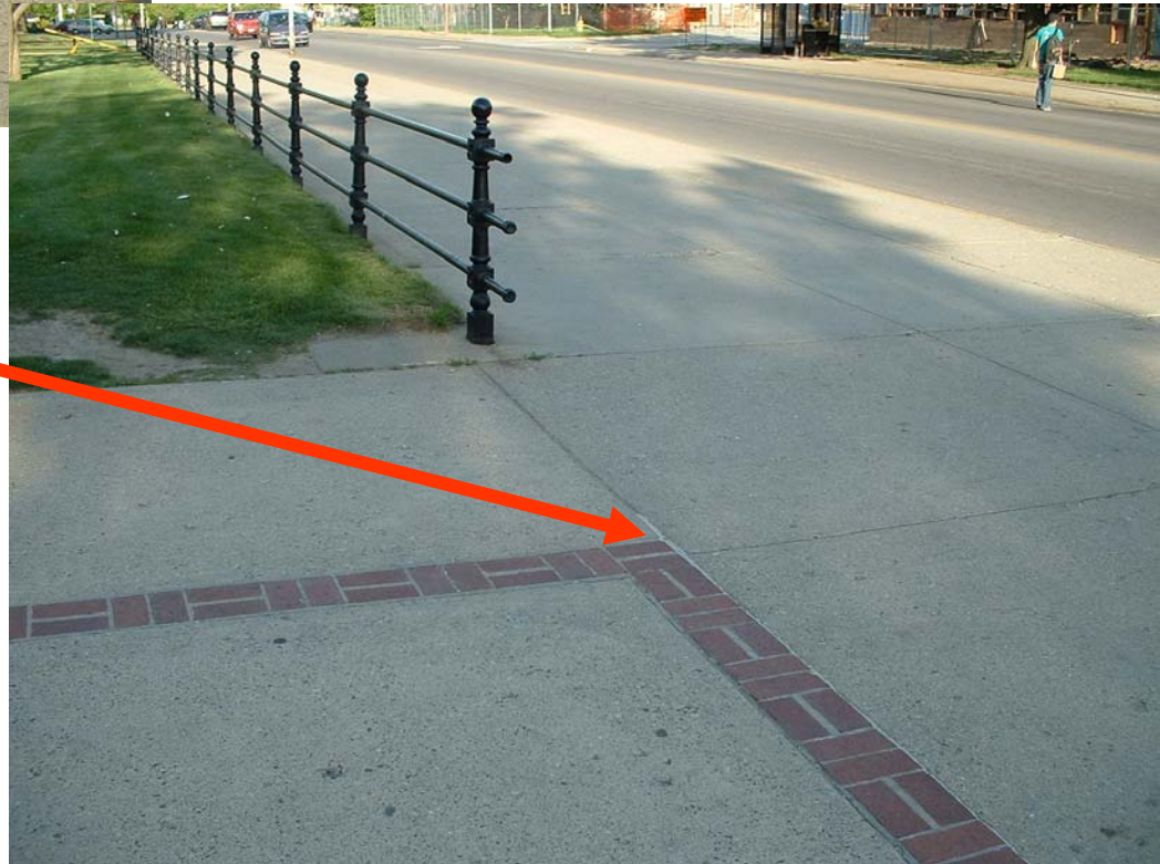
Photo ID point, outside corner of brick inlay in the sidewalk at main entrance to Lambert Fieldhouse on Stadium.