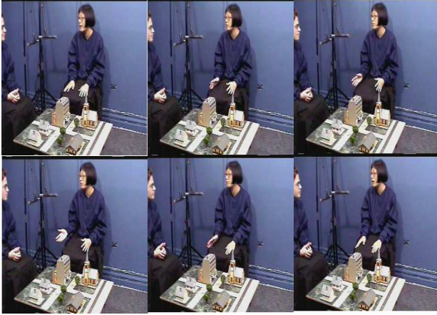
Figure 4. Key frames of gestures during our speech repair example.

tify the different types of gestural patterns that occur during speech repairs in our data sets. To get a better understanding of the process we used for the analysis, consider the speech repair appearing in Figure 3 with the following transcription: