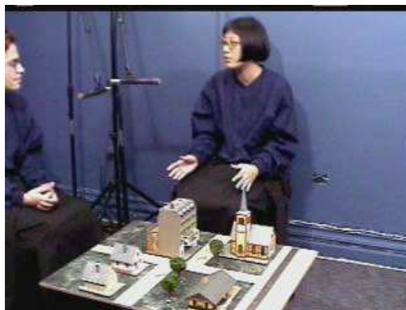
Figure 2. One frame of video in KDI visual-audio database.

and then downsampled to 14,700 KHz for analysis. One frame of video is shown in Figure 2.